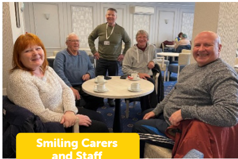
Smiling Carers and Staff