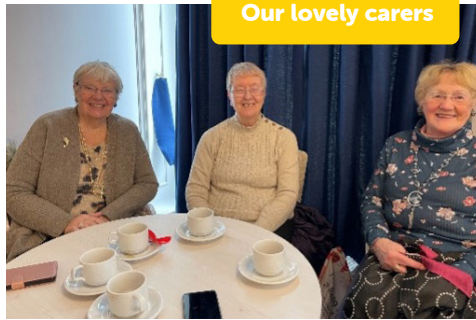
Our lovely carers